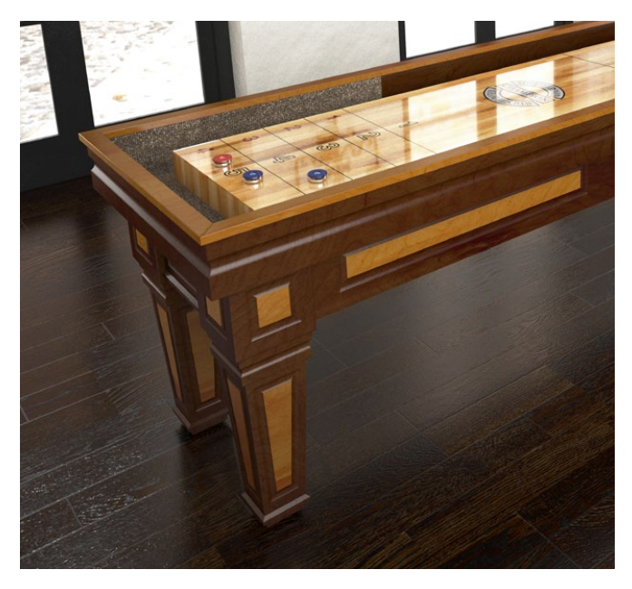
The digital images in this catalog are as accurate as possible. However, color may vary slightly. Contact your local dealer to choose the exact stain for your new table.

Your new Champion Shuffleboard table can be finished with any stain color desired. Choose from our standard colors or a custom stain to match the woodwork in your game room. Contact your dealer to arrange a custom stain match.