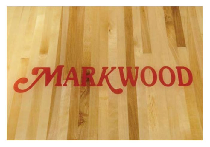
*College and professional team logos are copyrighted art. Written permission must be granted to be used.

Add personality to your new Champion Shuffleboard table with a custom logo built into the playfield. Proudly display the name of your bar, club, family name, favorite sports team, or any other logo to personalize your table. Simply provide your dealer with a high resolution logo file and we will take care of the rest.*