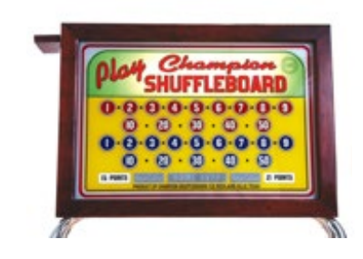
Vintage Score Unit Only available on Vintage Charleston.