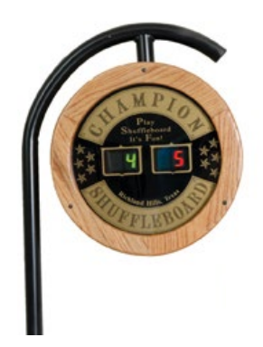
Wooden J-Bar Score Unit