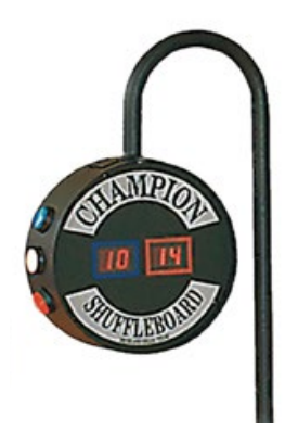
J-Bar Score Unit