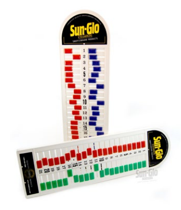
All Plastic Scoreboard Red/blue or red/green available.