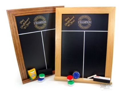
Framed Chalk Scoreboard 24" x 16" Light or dark stain available.